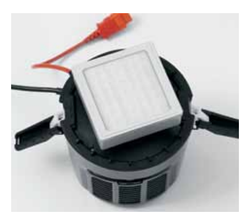
Easy to install optional HEPA filter for allergy & asthma suffers