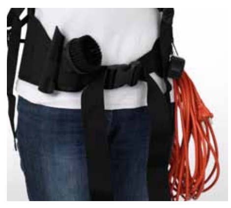
Accessories are stored on the belt for easy access.

JJ Wide selection of accessories available to meet specific applications.